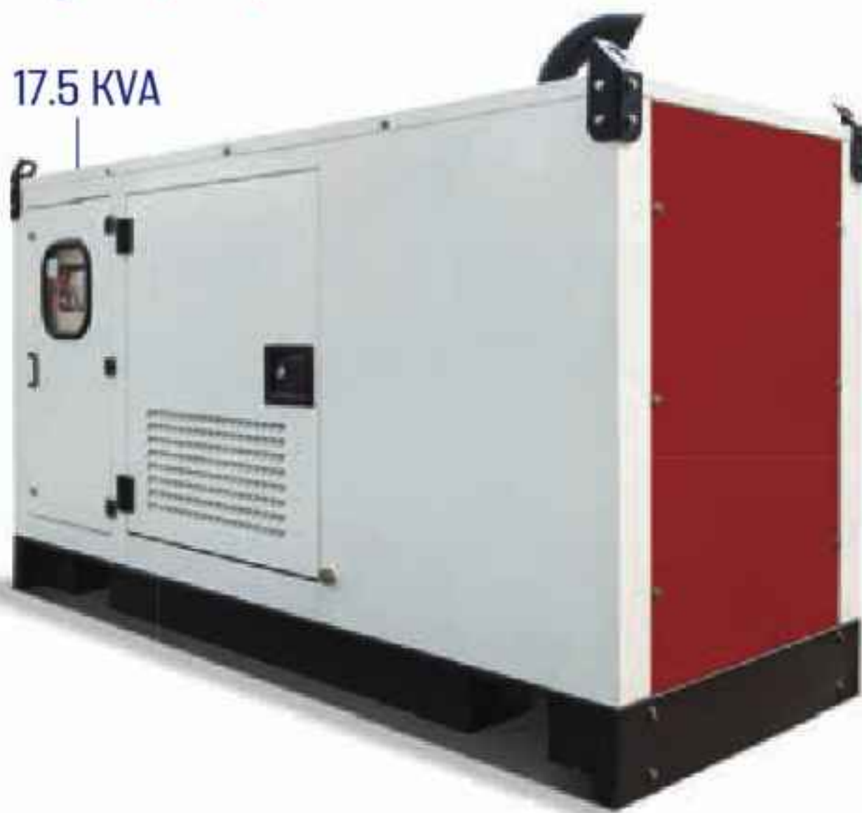
Inverter Ducted System Optimised Size Generator