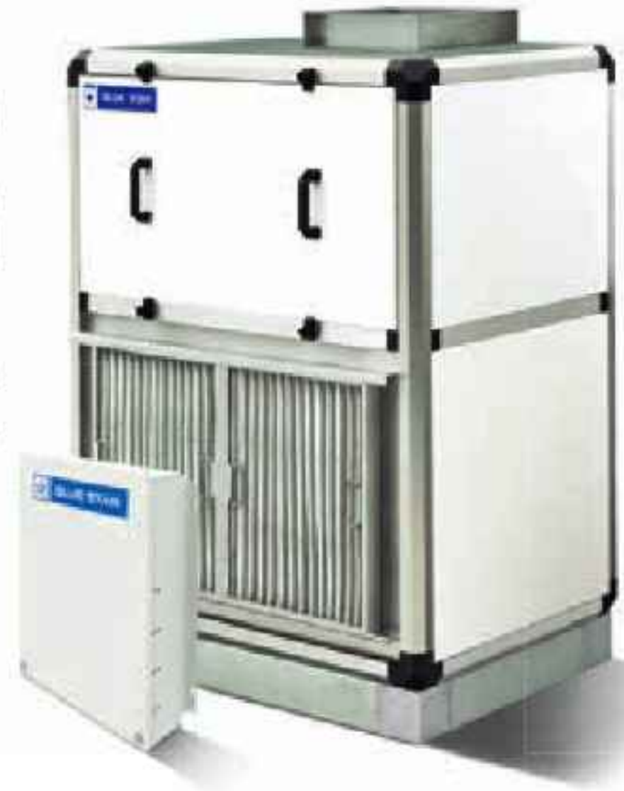
AHU Kit Range: 5TR to 22TR.

This feature is ideal for retrofit projects where we can replace the old conventional power gusting systems with energy efficient next generation Inverter systems.