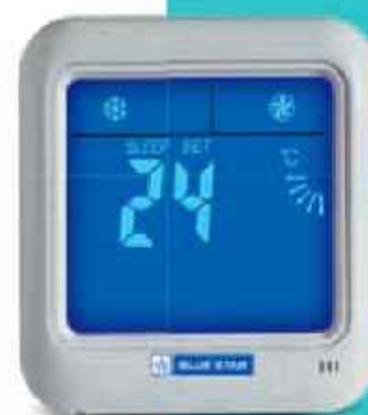
Touch Screen Controller Device